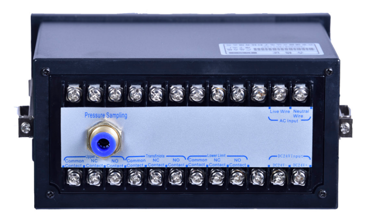
Figure 1-2 the back panel