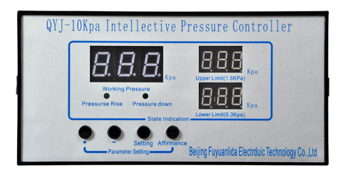
Figure 1-1 The front panel